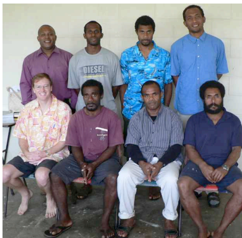
Diploma 1 Students